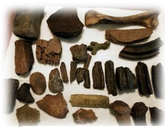
Figure 1 Fossils and other minerals in Peace River