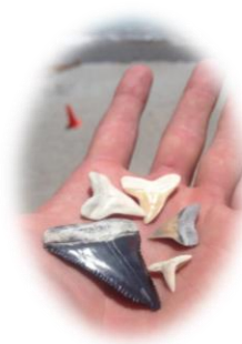
Figure 2 Shark teeth and other fossils at Venice Beach

The Sunshine State is rich in rocks, minerals, and fossils – making it a rockhound's dream. Keep reading to find enhanced lists and more specific details on rockhounding locations and what can be found where.