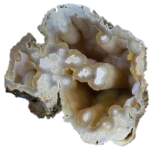
Figure 2 Agatized Coral, the official state gem, at Ruck's Pit

Some of the best places to rockhound in Florida include oceans, rivers, and other waterways. Many public and private lands are open to rockhounds with the right permits and/or permissions. Here are examples of what you might find at certain locations: